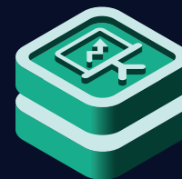
SILICON VALLEY ACCESS